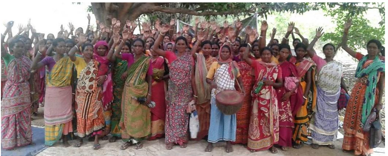
INDIGENOUS WOMEN IN DEMAND FOR PROTECTION & LEGAL ACTION AGAINST DOMESTIC VIOLENCE